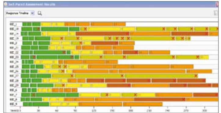
Pupil response chart

Once the ActivExpression devices have been given to the pupils, the assessment is launched via a single click on the interactive