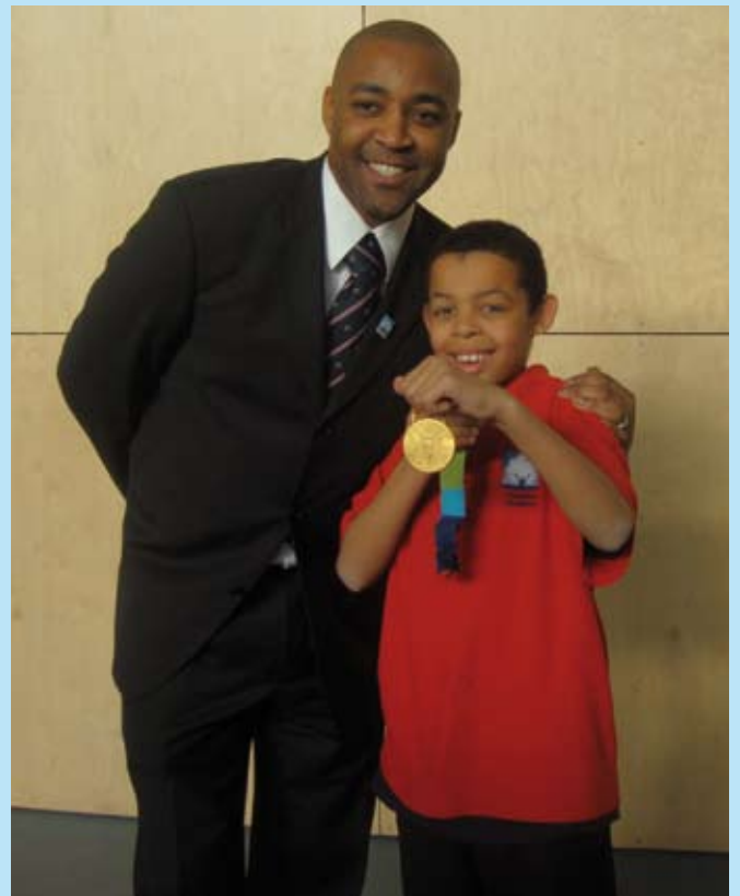
Olympic Gold medallists Darren Campbell and David Hemery visited Swindon Academy. Students had a chance to meet the athletes and hear their inspirational words. Darren encouraged the students: "Be the best that you can be."