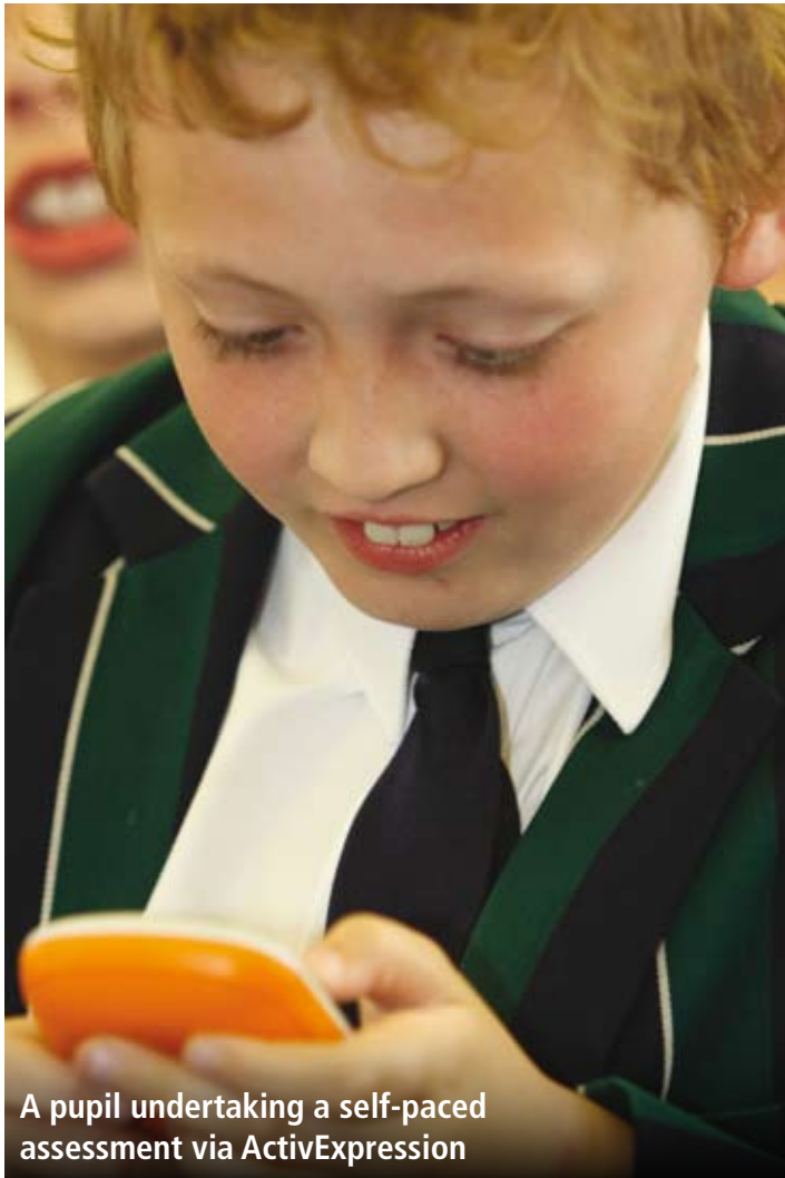
A pupil undertaking a self-paced assessment via ActivExpression

Teachers also have the facility to design tiered assessments where pupils have to get a designated number of responses correct before progressing to the next level. This immediately introduces opportunities for differentiation across the assessment task. Questions can also be distributed in a random order – a function which prevents copying.